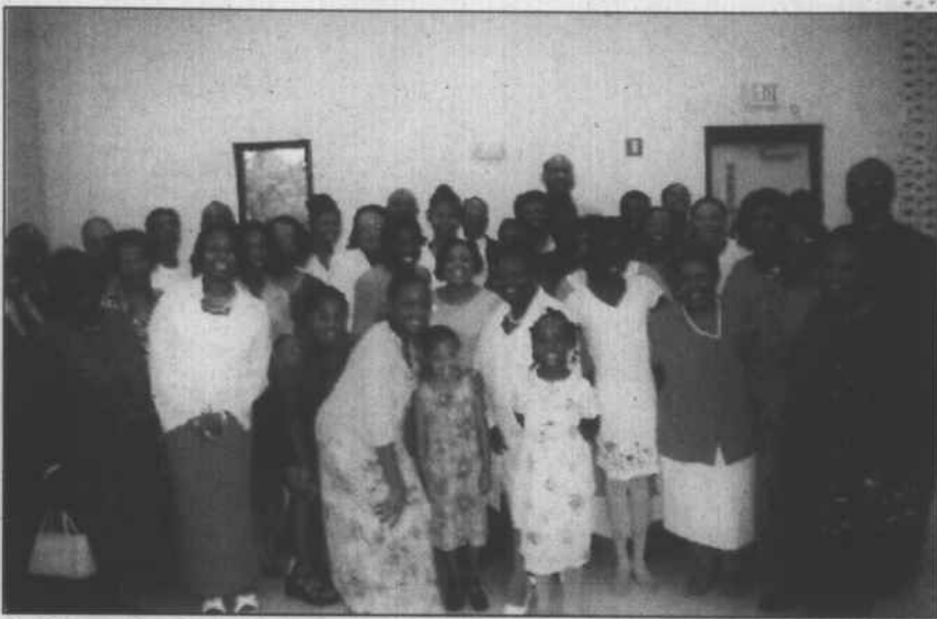
Family members from Charlotte, Winston-Salem and Georgia