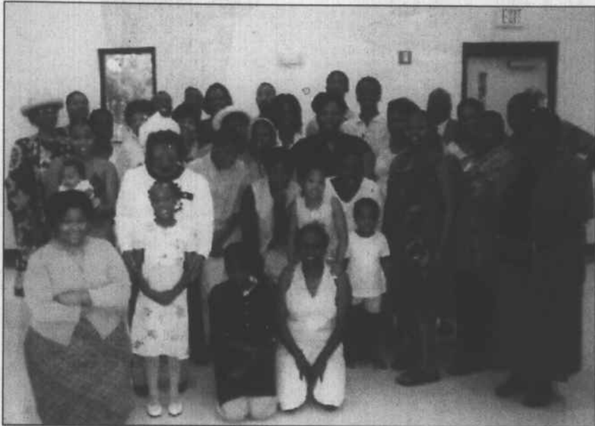
Family members from Salisbury, N.C.