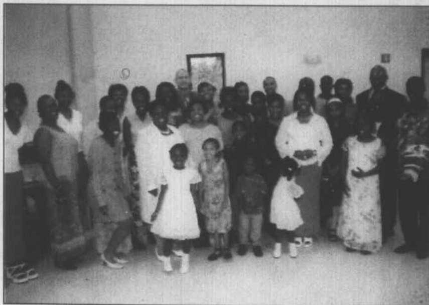
Family members from Fayetteville, Charlotte, Georgia and Winston-Salem

Family members traveled from various areas such as Charlotte, Lexington, China Grove and Salisbury, N.C., Georgia and Florida. About 175 people attended the events