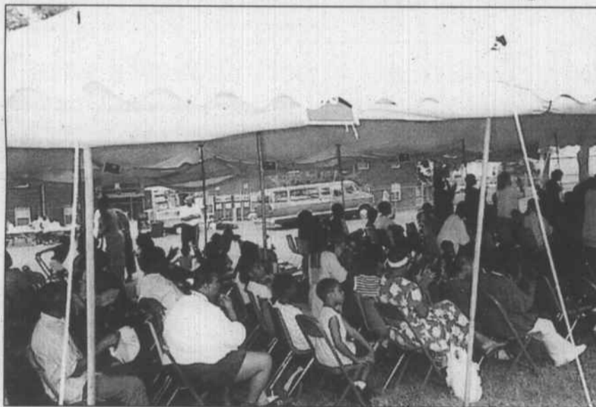
Scenes from the revival.