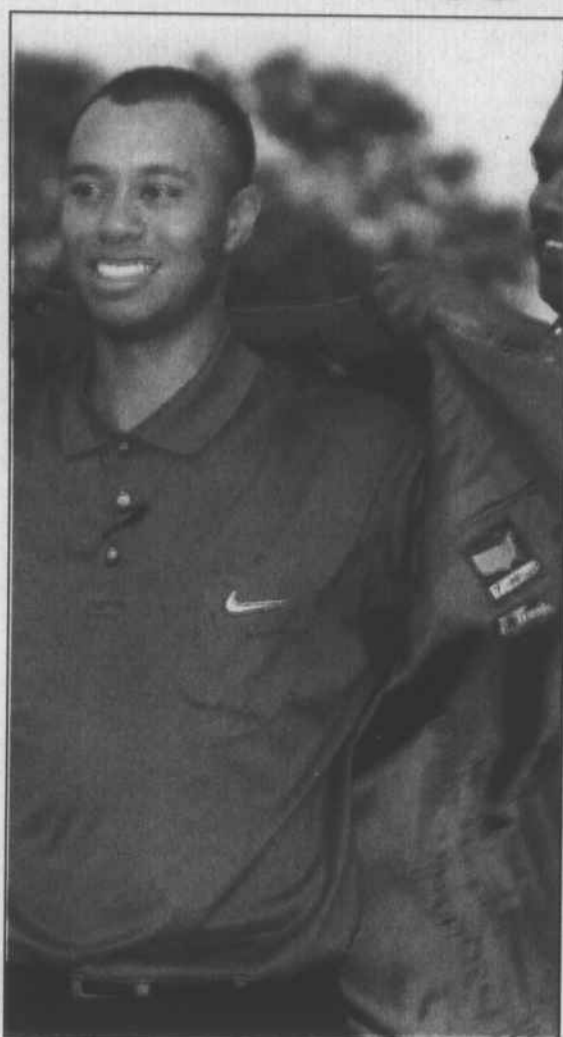
Tiger Woods is one of the favorites to wear the green jacket at the next Masters in Augusta, Ga.