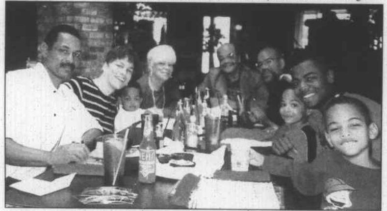
Roland Hayes and family during a Father's Day dinner.