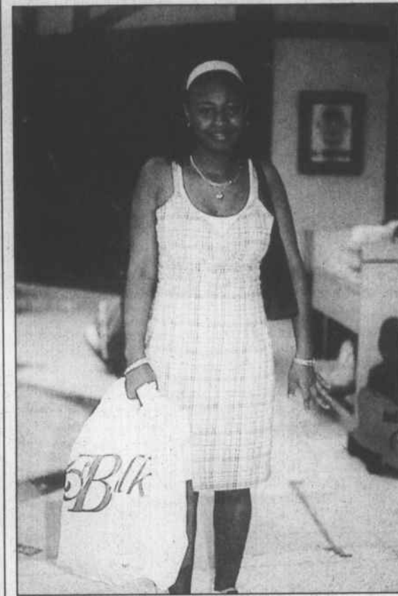
Shoppers will hit the mall in force this weekend.

For more information on the Sky Show, log onto www.wqmg.com or www.ljfm.com .