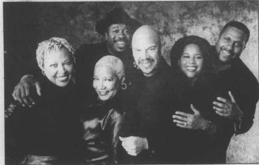
Most members of the Tom Joyner Morning Show are expected in Winston-Salem.