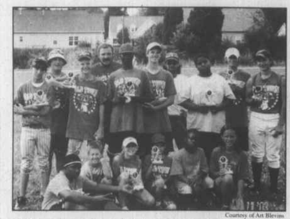
Old Town sluggers completed a perfect season.

With victories over Martin Luther King and another win over Sprague Street centers the last two weeks, Old Town closed out a flawless season. But, everyone in the Old Town