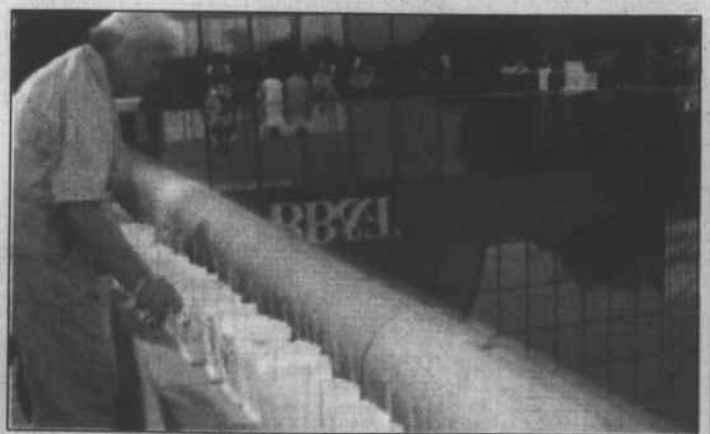
Organizers prepare the lanterns to be placed on the water.