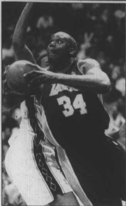
File photo Shaquille O'Neal has been doing a lot of crying about his future in Los Angeles lately.