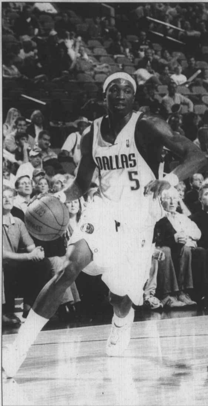
Former Wake Forest star Josh Howard has made an immediate impact on his team in only one year of action.