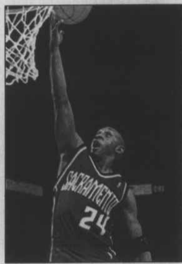
Bobby Jackson will host a camp in Salisbury July 18-23.

G. Komen Foundation in support of breast cancer research. Jackson graduated from Salisbury High School in 1992 and attended the University of Minnesota, where he was named Big 10 Player of the Year and Big 10 Defensive Player of the Year as a senior. He was named to the NCAA All-Final Four Team and the