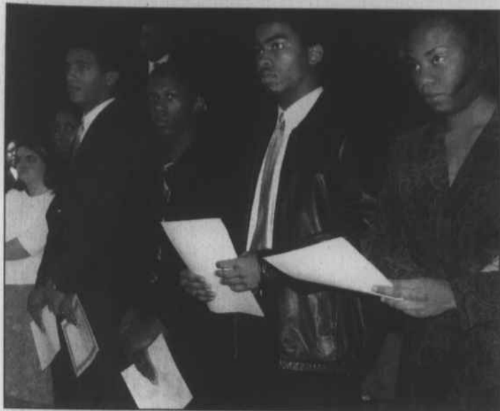
Some of the scholarship recipients from the last Emancipation Association event are recognized during the program.