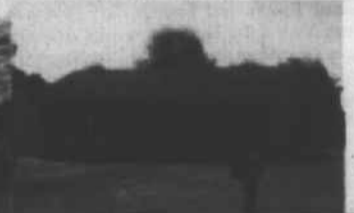
MLS# W370162 - $80,000

4325 Oak Ridge Dr. First time home buyer must see! Cute rancher in move-in condition, open floor plan /eat-in kitchen. Large LR & comfortable size MBR. AHS Warranty