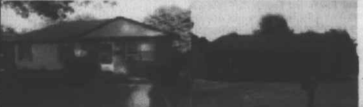
MLS# W370056 - $73,000

4548 Lasley Drive GREAT RANCHER! Bay window, pass through Kitchen, vaulted ceiling in LVR & Foyer, plant shelf, arch opening, laminate flrs in LVR & DR, crown molding in DR & MBR, TV Niche. AHS Home Warranty