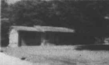
MLS# W370158 - $101,000

4126 Eisenhower Rd. Hurry, first-time home buyer! Great rancher in good condition. Eat-in Kitchen & comfortable size LR & MBR. Nice level lot. AHS Warranty