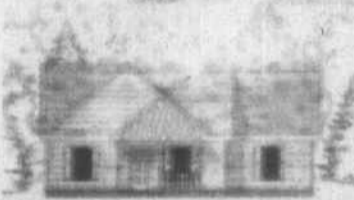
MLS# W365874 - $129,900

3 Wyandotte Ave. - NEW! $2500 Closing Cost...Cathedral ceilings in LFR & kitchen, large walk-in closet in MBR. Extra features, buyers choose colors. Close to shopping centers.