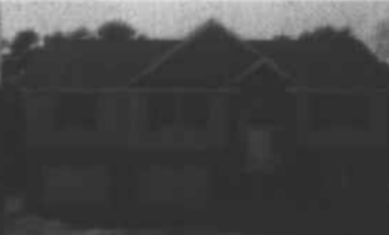
MLS# W362266 - $174,900

3555 Cortland Drive Fabulous NEW Home, HWD FLR in DNR, Open FLR Plan, Plenty of Closet Space, Great Corner lot. Builder will pay ALL Closing Cost and Down Payment with Preferred Lender.