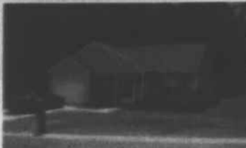
MLS# W362250 - $114,900

3640 Cheshire Wood Dr Like New...Split BR plan with cathedral ceilings in LR and a large walk-in closet in MBR. House located at the end of cul-de-sac. Great family community