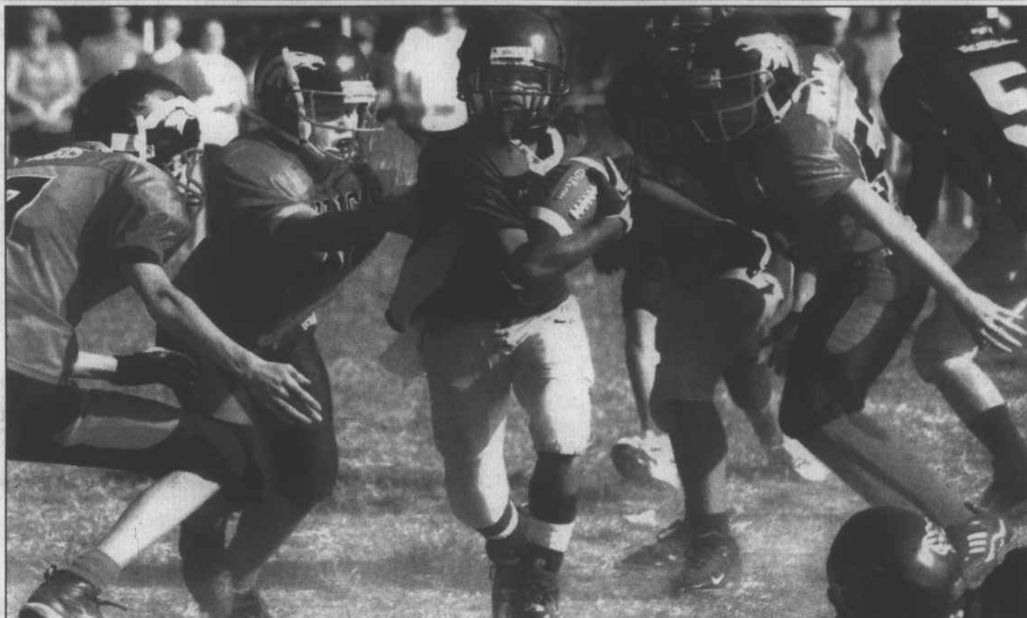
A Titan running back looks for running room during a 20-0 win over the Forsyth County Broncos over the weekend.