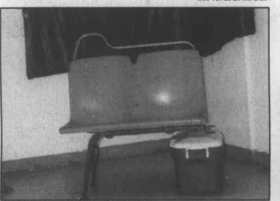
One of the seats from the old Safe Buses.