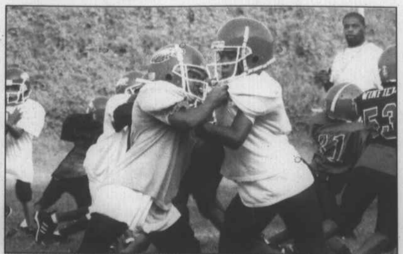
Here, a group of Falcon players get after it during a practice last year.