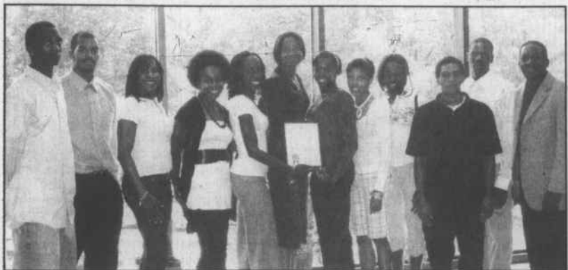
St. Aug. photo