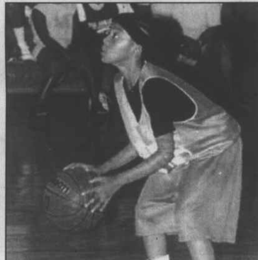
Perez launches up a shot attempt.

put the team together, but she allowed me to help coach them. I definitely got