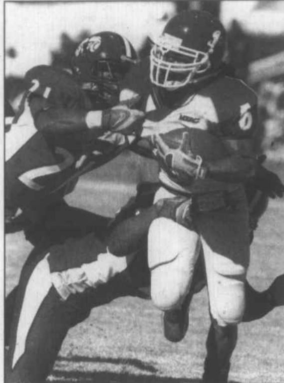
Delaware State is ready to run wild in the Div-IAA playoffs.