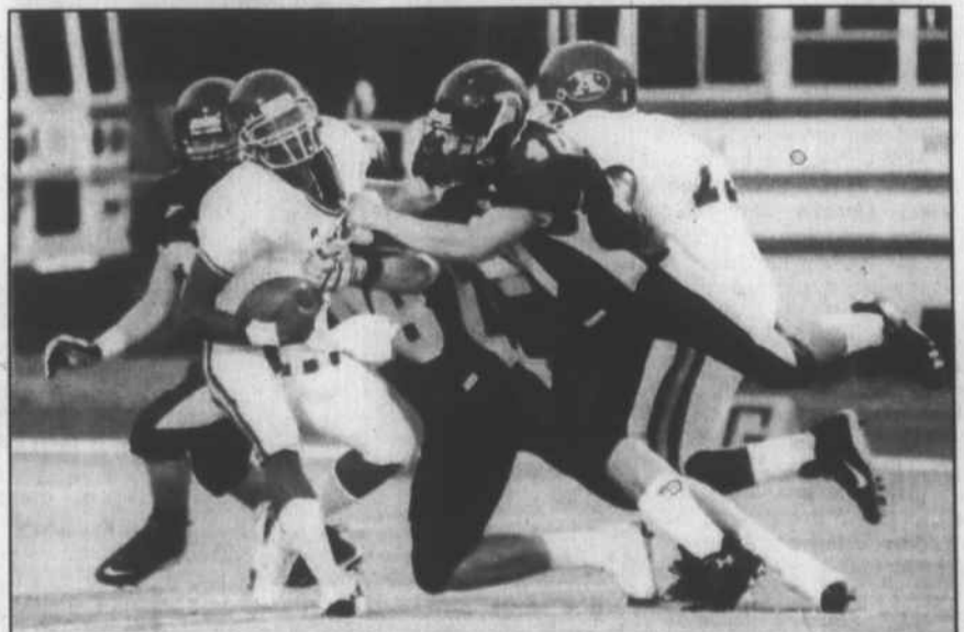
Mt. Tabor fall sports captured a Wachovia Conference Cup.