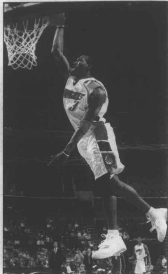
Here, Bobcat star Gerald Wallace slams one home.