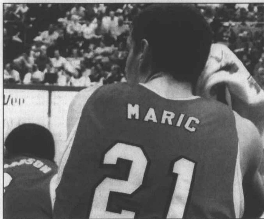
Huskies Sports Pic

ticipate in its leagues and tournaments for allowing the park to proudly achieve the honor.