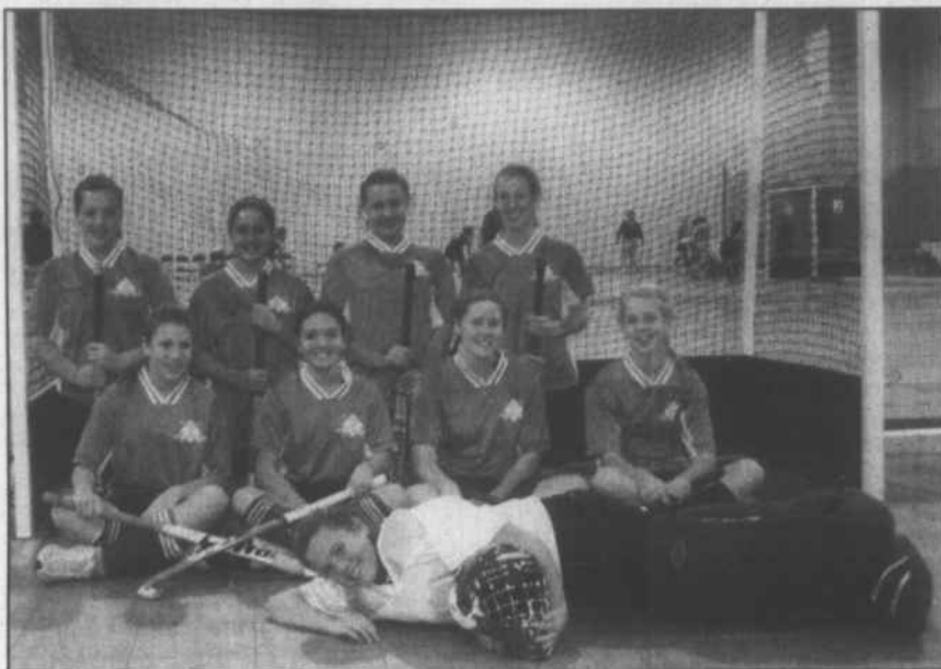
Members of an elite high school field hockey team, sponsored by the W-S Optimist Field Hockey program, pose for a photo.

The players representing the Winston Salem Optimist Field Hockey Club came from five local high schools: Mt. Tabor, West Forsyth, Forsyth Country Day School,