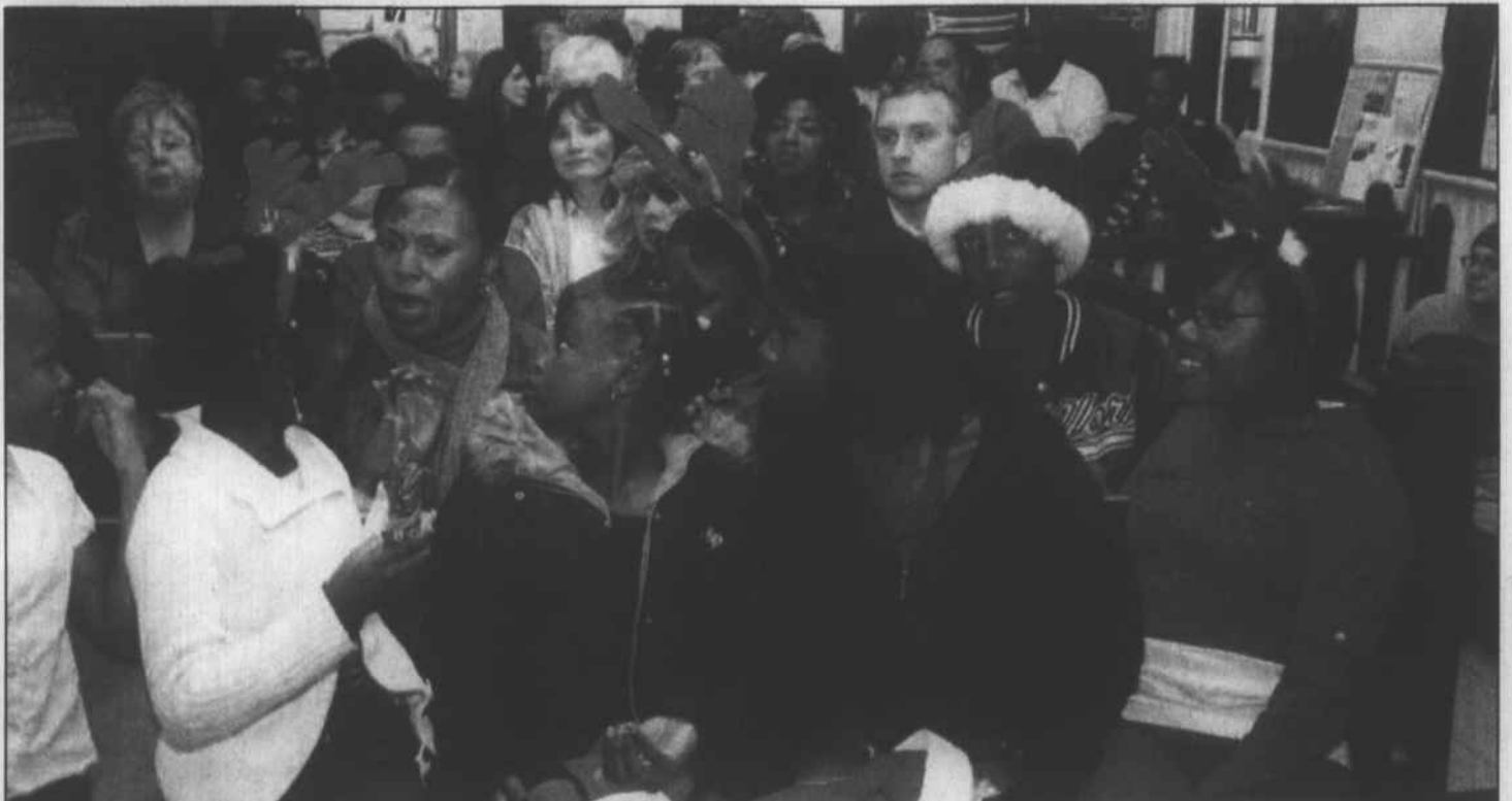
Dozens showed up for the recent concert fundraising event.