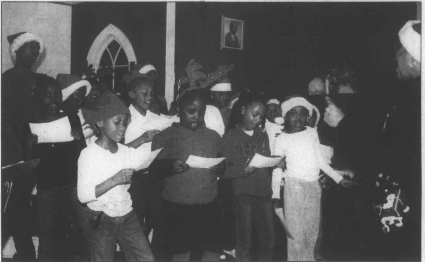
The Grace Presbyterian Church Youth Choir performs.

Crooner Freddy Cole, (Nat King Cole's brother) will appear in concert Monday, Dec. 31, 8 p.m. at the War Memorial Auditorium in Greensboro. Tickets are $5 for a limited time. Call 336-335-5456, ext. 223 to purchase tickets and for more information.