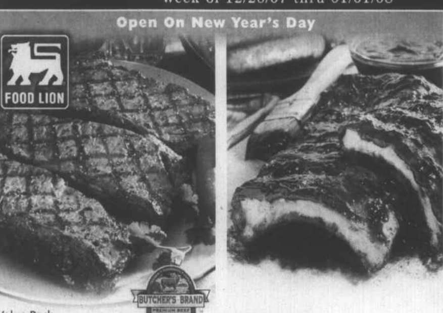
Value Pack New York