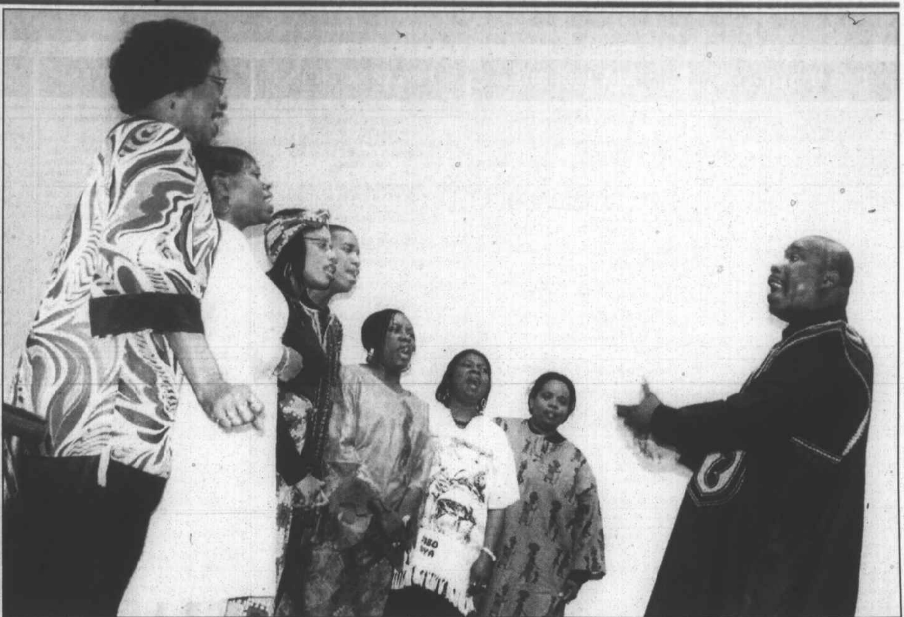
Members of the Ambassadors for Christ Choir perform.

The public is invited to support Komen NC Triad and the 2008 Race for the Cure by joining Wake Forest University Baptist Medical Center and Allegacy Federal Credit Union for a Dessert Auction, Saturday, April 19 at Belk Court in Hanes Mall. The preview starts at 10 a.m., with the live auction underway at 11 a.m. In addition to sweets donated by area bakeries and restaurants, there will be other goodies on auction and some great door prizes.