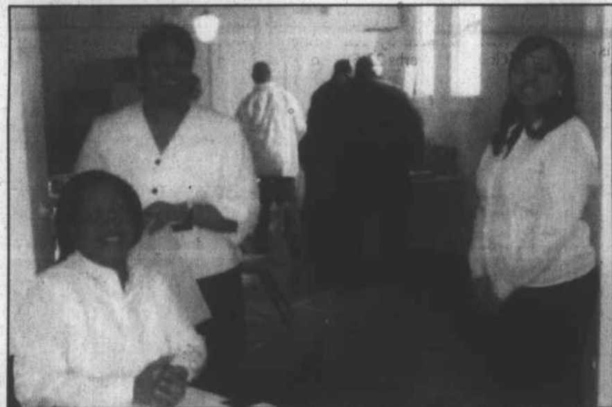
Church members prepare to welcome participants to the event.

Through the presentation, participants learned that there is good and bad debt. Some examples of good debt are