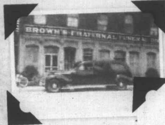
OUR FIRST LOCATION 1928-1937

We pause to thank the community for your support during the past 80 years, and rededicate ourselves to service in the years ahead.