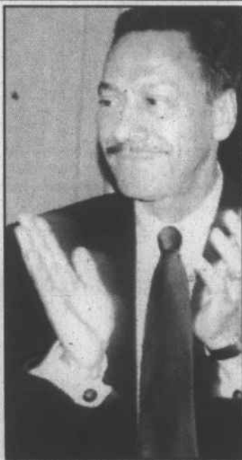
Mel Watt represents the 12th District of N.C.

"The grants conferences have proven to be very valuable resources for governments, agencies and individuals seeking grants from the federal government," Watt said. "We try to improve the information and resources we provide each year and have gotten great feedback from our efforts."