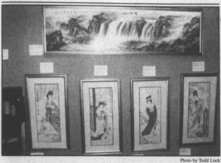
Some of the pieces from China available at World Exchange.

The prefects work together with the headmaster and the faculty in the operation of the school. Elections were held at the end of the school year. Both students and faculty voted on who should be the prefects. South Kent has maintained ties with the Episcopal Church since it was founded in 1923, but nurition