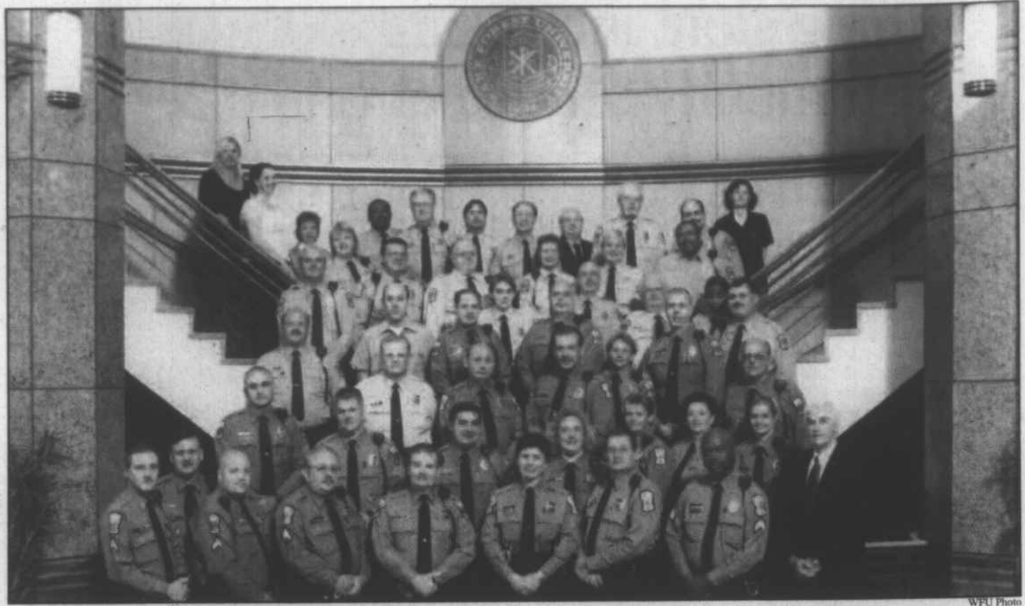
The Wake Forest University Police Department family.

IACLEA, with headquarters in West Hartford, Conn., represents more than 1,200 educational institution members and 2,000 individual members by providing educational resources, advocacy and professional development services.