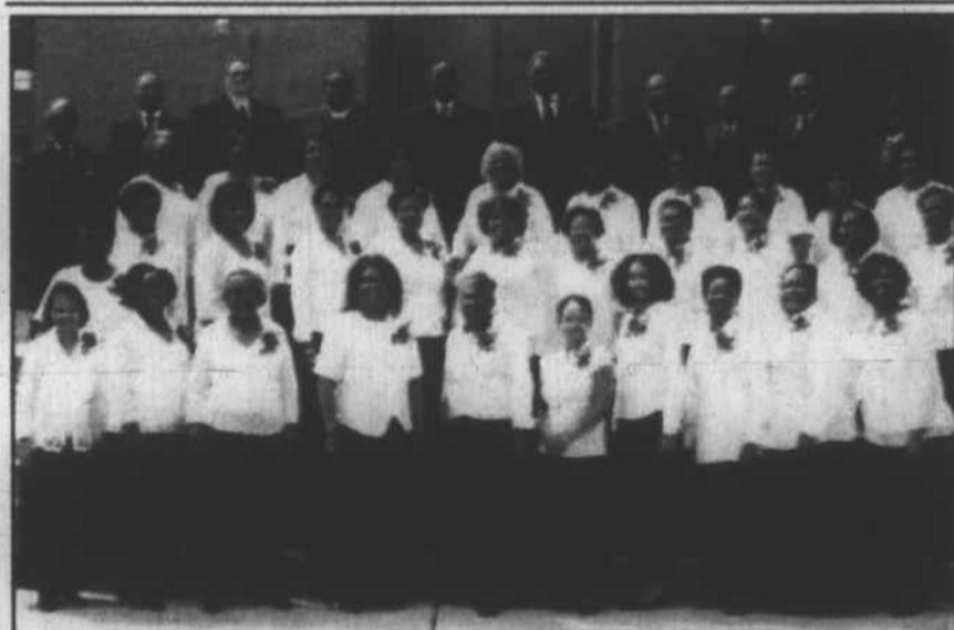
The Inspirational Choir of Mount Zion Baptist Church