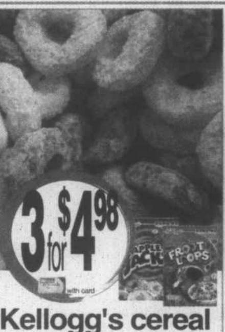
Kellogg's cereal rice krispies 9 oz, frosted flakes 14

oz, froot loops or apple jacks 8.7 save at least $4.47 on 3