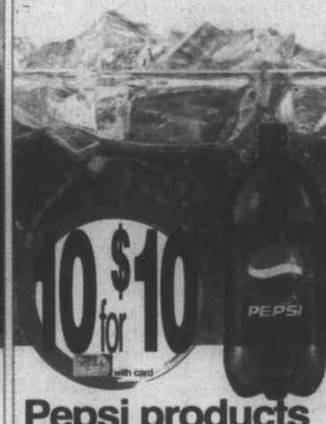
Pepsi products selected 2 liter