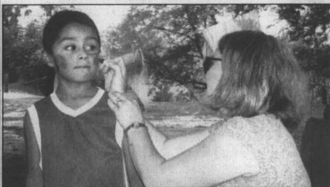
Below: A young boy gets his face painted during the celebration.