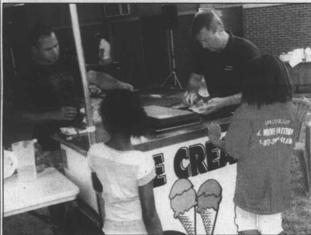
Two girls wait for a cool treat.