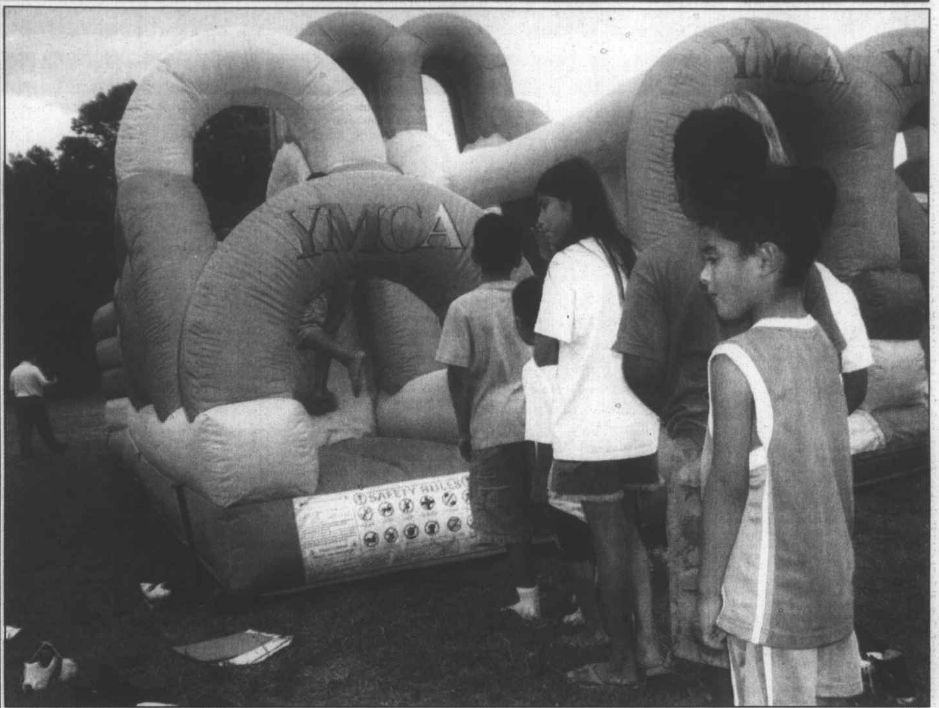
Academy students enjoy one of the attractions at last week's celebration.