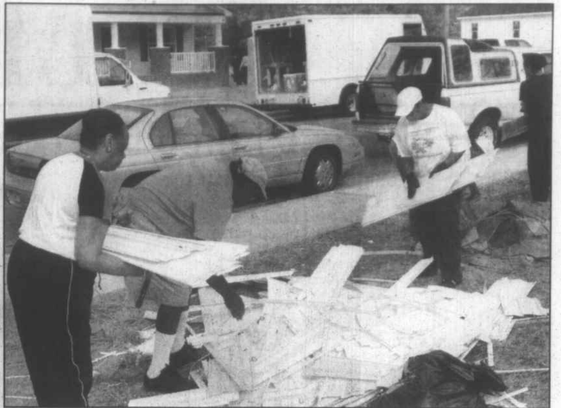
Activity at a recent Habitat of Forsyth build.