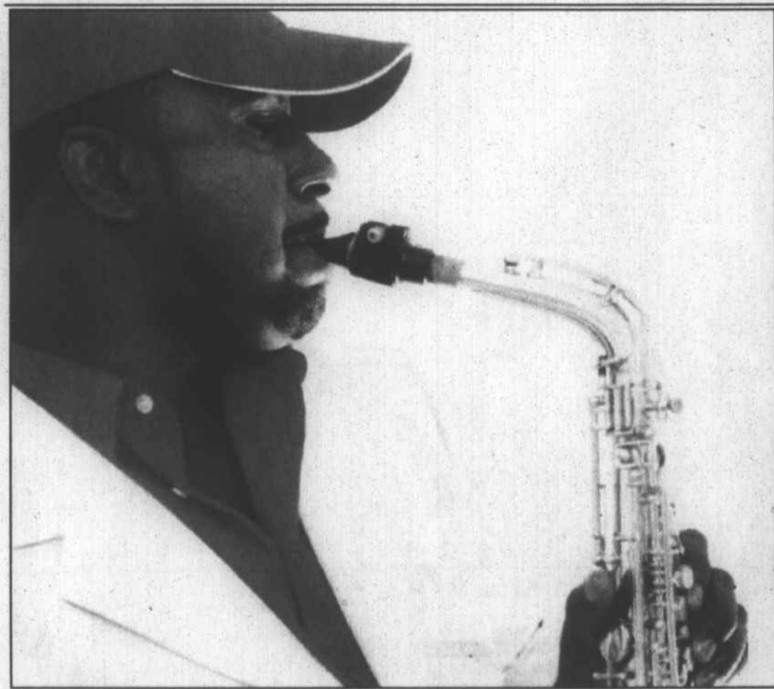
Boyce PR Photo

Tickets for the banquet are $10 for adults and $5 for children 12 and under. For more information, call the church office at 336-499-7380. The public is cordially invited to attend.