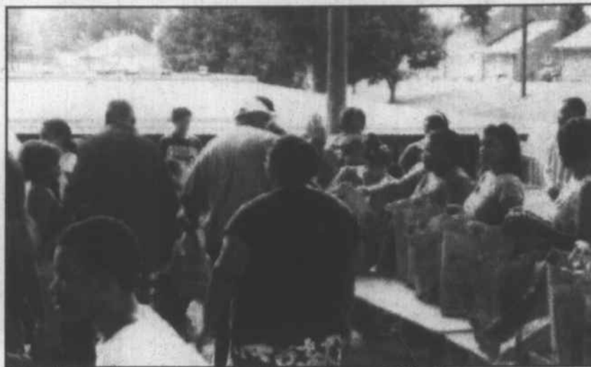
Church members and young people at the recent bash.

A mobile stage and chairs were set up near the community center for entertainment provided by church members. A few of the various ministries that provided entertainment were the adult Victory In Praise (VIP)