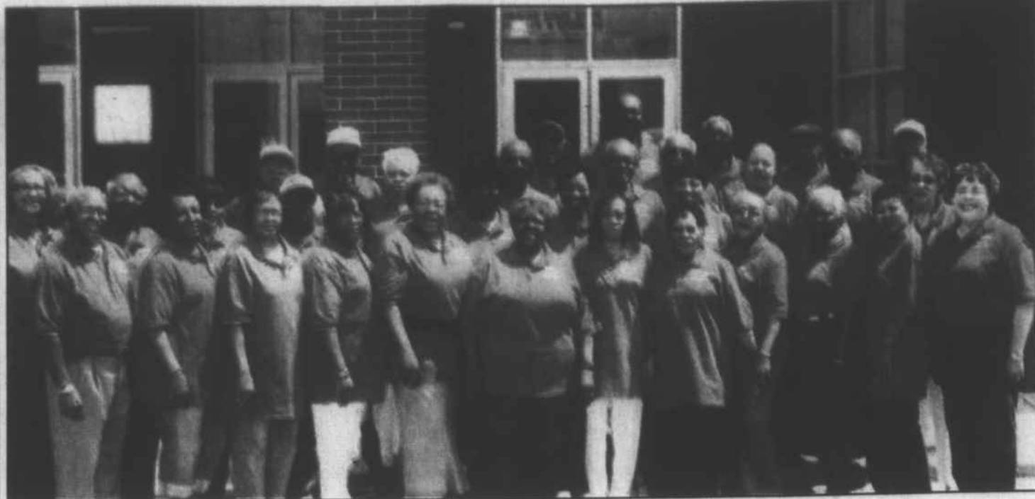
Members of the Class of '58.

The United Nations' International Day of Peace and Global Ceasefire was