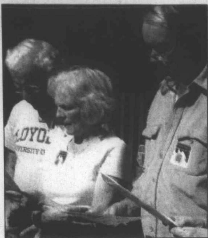
Locals read a litany of peace during the 2006 event.