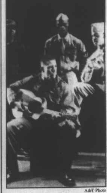
The actors bringing ". Soldier's Play" to the stage. "A