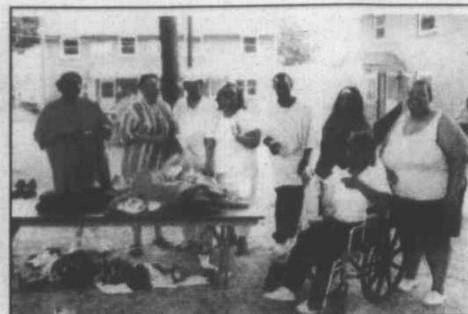
A scene from the Cleveland Avenue Homes project.