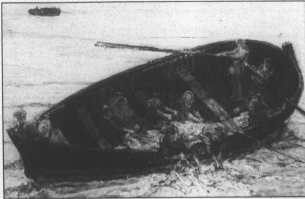
National Academy Museum, New York