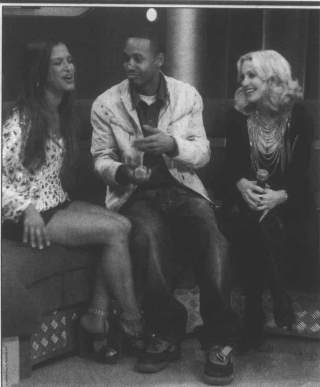
Terrence J with co-host Rocsi, left, along with Madonna on an episode of "106 & Park."