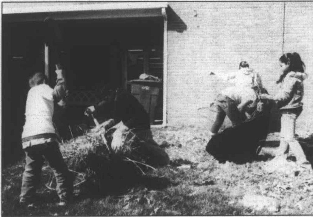
Above: Kimberley kids clear leaves, weeds and other brush from school grounds.