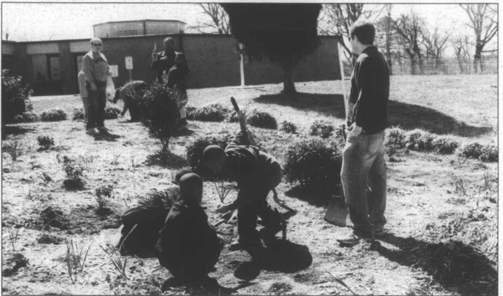
Volunteers beautify the front of the school.

If you or a family member is struggling with substance abuse HELP is a phone call away. The Twin City Area Narcotics Anonymous Helpline can be reached at 800-365-1035 or online at www.tcana.org . For meeting schedules and additional information for this 12-step Recovery Program, please call the number of visit the Web site.