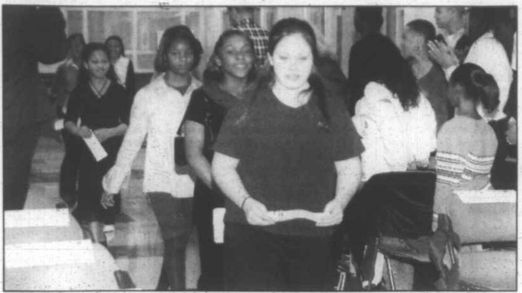
Recent graduates of the Trashbusters program.