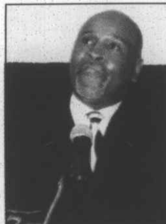
Bishop Sheldon McCarter gives remarks.

A staggering 98 percent of youths who take part in Black Achievers go on to an institution of higher education. Two groups of students fall under the Black Achievers umbrella. The Collegiate Achievers program is geared towards high school students, while the Youth Achievers program serves middle schoolers.