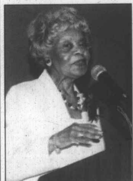
Mayor Pro Tempore Vivian Burke.