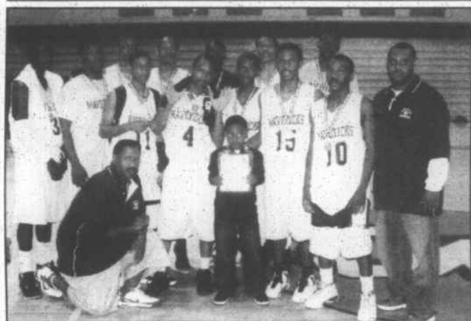
The 14U squad.