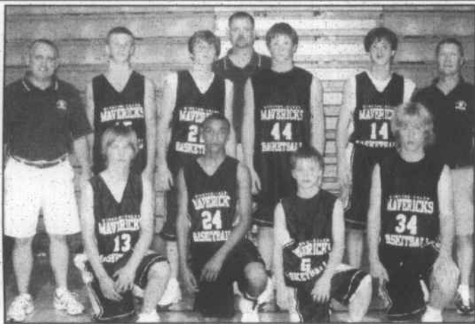
The 15U squad.