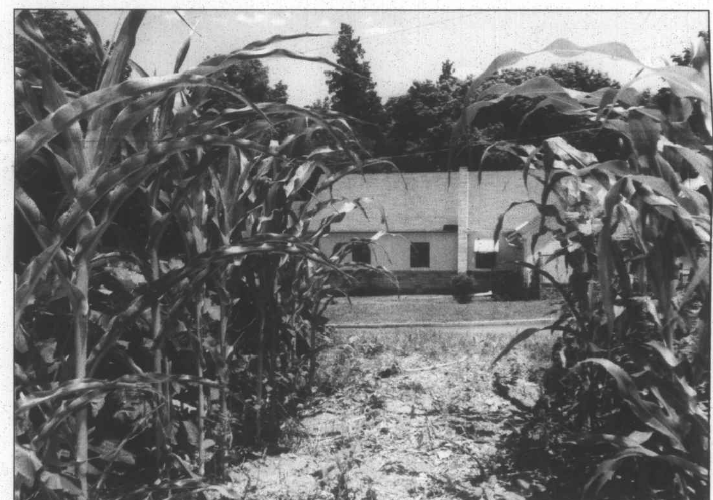
The garden sprouts from an acre of land across from the church.

with a grin and a laugh. Alpha & Omega originally purchased the land with the intent of building a parking lot, but when the church couldn't raise the funds to have the area paved, it abandoned that idea. Instead, Huntley planted a small garden there and vowed to live a healthier life by eating the vegetables he grew. He allowed others in the East Winston community to use some of the space to grow things of their own. Before Huntley realized it, the garden had taken on a life of its own and had ballooned in size