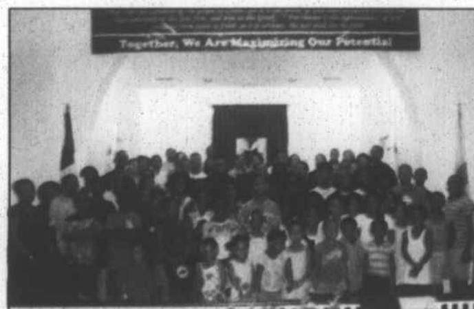
Some of the youth attendees.

Vacation Bible School officially kicked off on Monday, June 15 and continued until Friday. The classes were divided into four groups - Pre-K thru 1st grade; 2nd-5th grades; middle school; and high school. The theme of the week was "Studio Go!" and each night, classes went to different