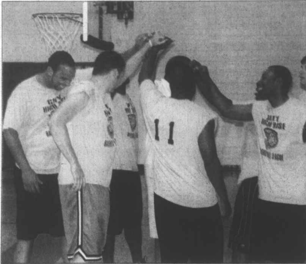
The Stars huddle.