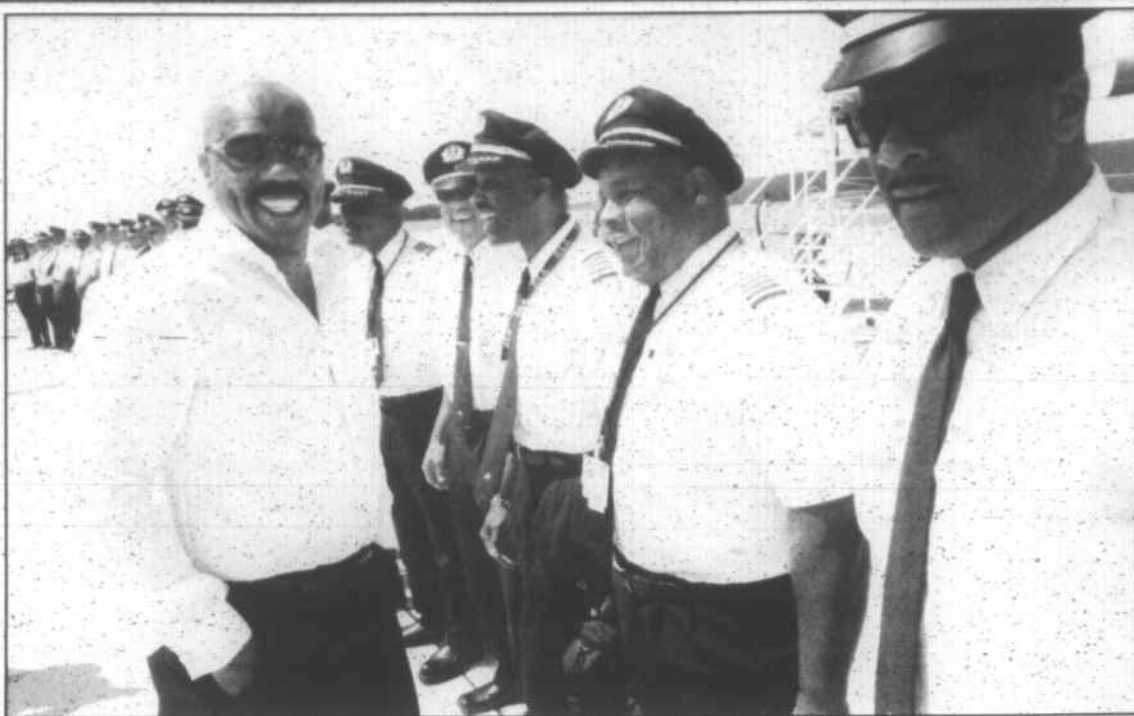
Steve Harvey greets American Airlines pilots.