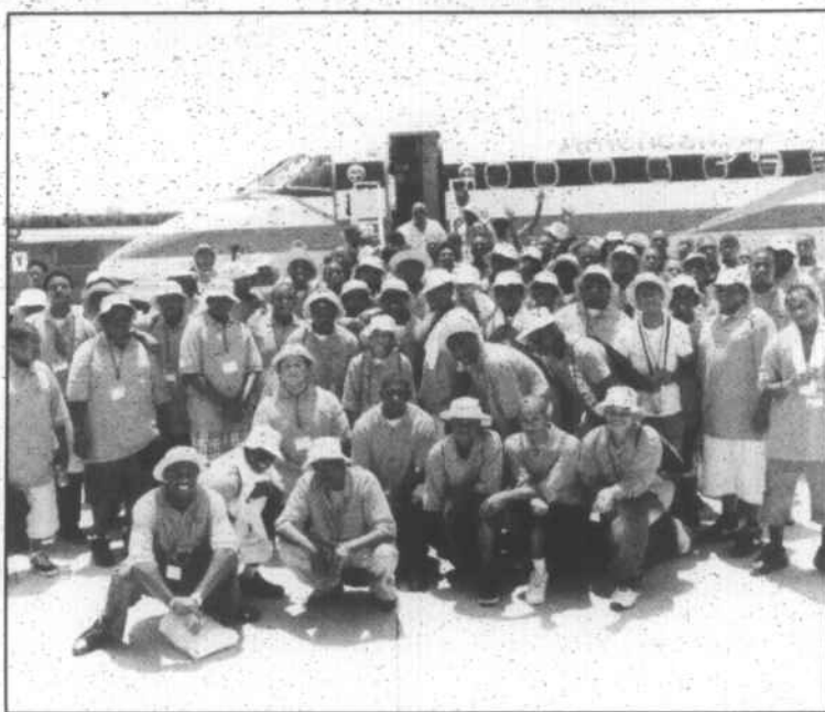
The 100 boys chosen for the weekend.

"My hope is that these boys left the ranch so inspired that they, in turn, will set the example for other young men in their neighborhoods," Harvey said. "The weekend was a complete