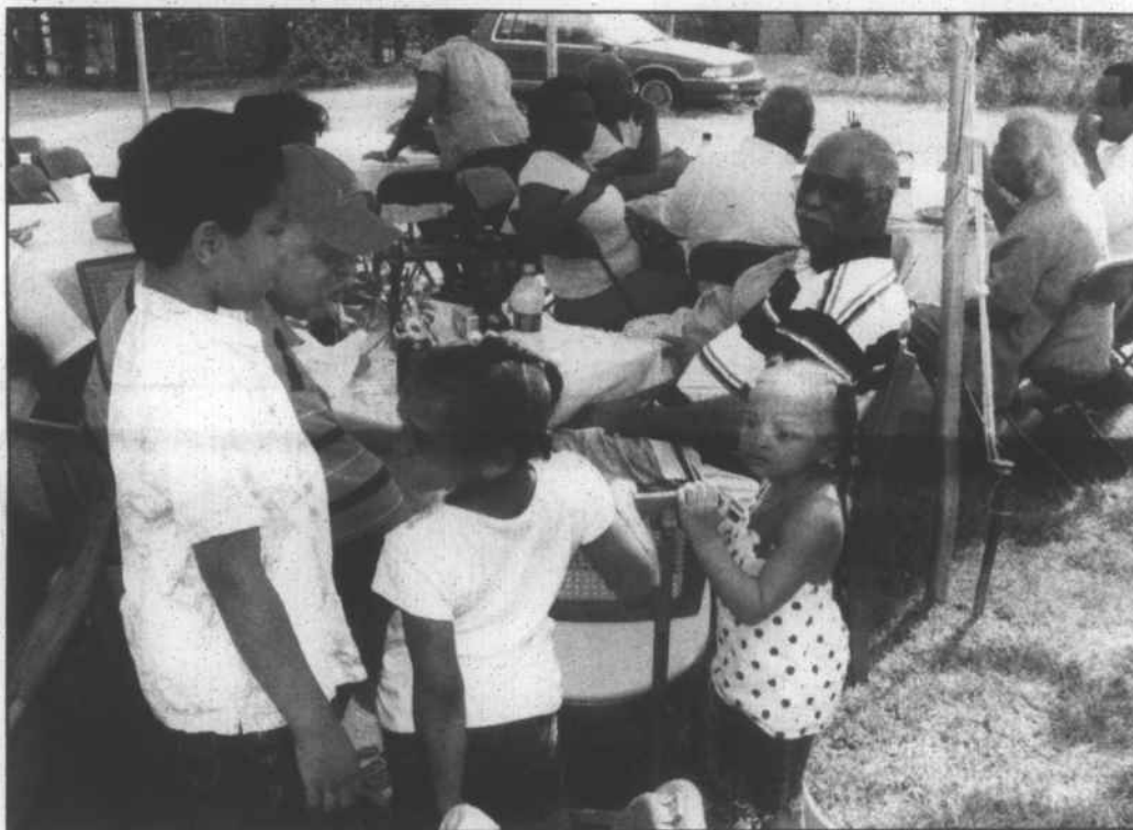
Attendees of all ages were on hand for the celebration.