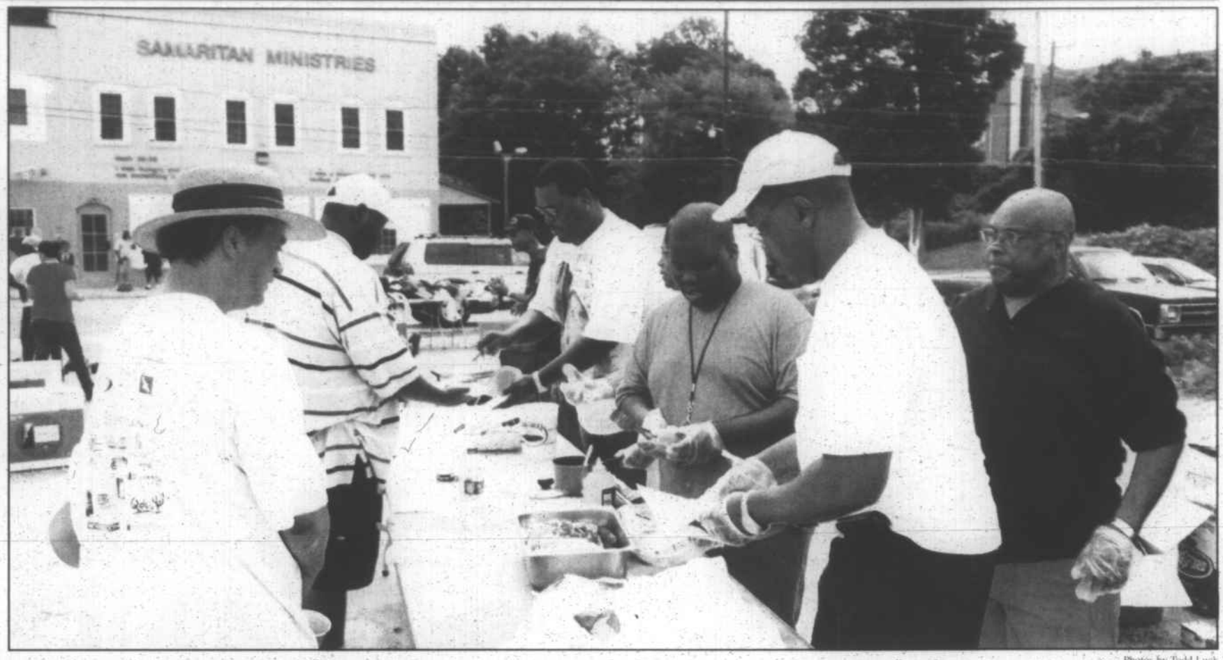
The event had no problem drawing a crowd on Saturday.

The Winston Lake Family YMCA, 901 Waterworks Road, will welcome members of the N.C. Chapter of the Buffalo Soldiers on Tuesday Aug. 11 at both 10 a.m. and 5:30 p.m. The chapter is dedicated to keeping alive the legacy of the legendary African-American military unit. Call 336-724-9205 for more information.