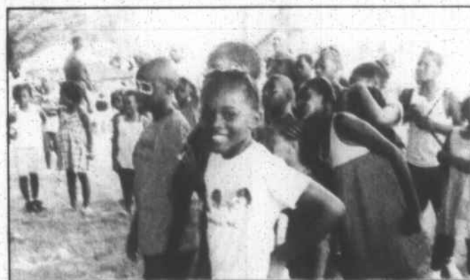
Kids enjoy the day of fun.

The crowd filled the church's parking lot to enjoy a menu of fish, barbecue, burgers, hot dogs and assorted desserts. Among the highlights was the distribution of more than 200 bags filled with school supplies for area children. There were also free screenings for diabetes, cholesterol and high blood pressure. Attendees also took part