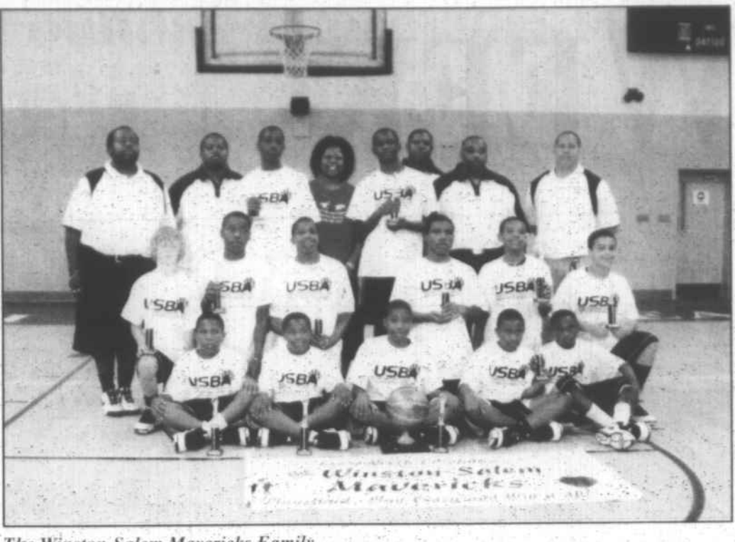
The Winston-Salem Mavericks Family.