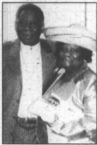
Bishop and First Lady Patterson

The Moravian Church, which celebrated its 550th anniversary in 2007, is one of the oldest Protestant denominations, dating back to 1457 in Europe and first coming to America in 1735. Moravians have a strong tradition of ecumenical work and are best known for their missionary work and rich musical heritage.